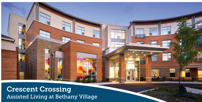
Crescent Crossing Assisted Living at Bethany Village

Bethany Village Graceworks Lutheran Services